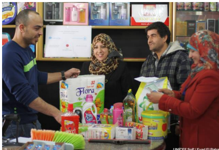
Gaza City – Palestinian families receive essential hygiene products in a shop as part of the UNICEF-WFP e-voucher programme in February. The joint programme has benefited more than 8,000 families in Gaza.

In the West Bank, UNICEF in cooperation with the NGO Gruppo di Volontariato Civile (GVC) continued water distribution in the most vulnerable communities in Area C. In February, more than 2,000 m 3 of water were distributed benefiting 1,500 people. Since the beginning of the project more than 30,000 people (50% children) have benefitted from access to drinking water through repairs, upgrades of water networks and water distribution in the water scarce areas. UNICEF in coordination with OCHA and UNRWA provided assistance through the WASH Cluster in coordinating the distribution of fuel to critical WASH facilities, particularly in Rafah and Eastern villages of the Gaza Strip.