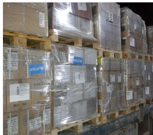
Gaza City – 186 pallets of essential drugs delivered by UNICEF to the Ministry of Health in Gaza.

Also in the West Bank, UNICEF distributed 13,529 packs (0.8 ton) of iron & folic acid tablets to the Ministry of Health that benefited more than 10,000 people.