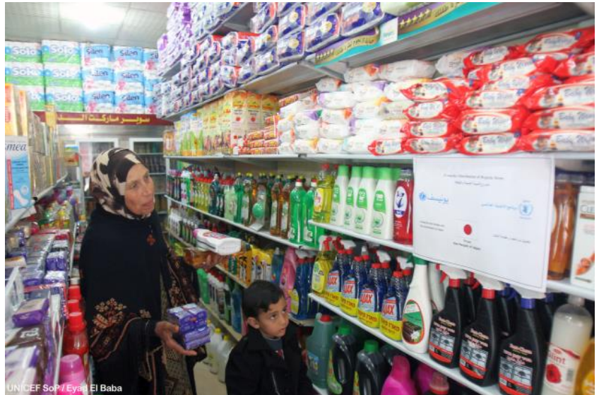
Gaza – Palestinian families redeem e-vouchers for school children. Since the beginning of the joint project between UNICEF and WFP more than 8,000 school children have benefitted from education supplies such as school uniforms, shoes and winter clothes.

In February, the Adolescent Development and Participation programme (ADAP), through its partners Al Nayzak, INJAZ, PalVision, Tamer, Save Youth Future Society and Ma'an Development Center supported 839 adolescents with skills development and training in implementing and leading initiatives addressing issues of conflict, violence, and social cohesion. Since the beginning of 2016 a total of 2,141 adolescents (43% female) have benefited from the programme.